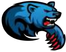
John Marshall Enterprise High School